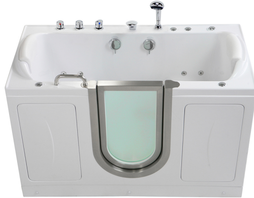
M3085-HB Center Drain Only

Actual Size: 30.25" W x 59.75" L x 38" H Shipping Size: 35" W x 65" L x 45" H Shipping Weight: 320 lbs. Net Weight: 220 lbs. Water Capacity: 95 gal. US (unoccupied) 45-65 gal. US (occupied)