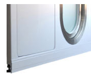
Baseboard On (not supplied)