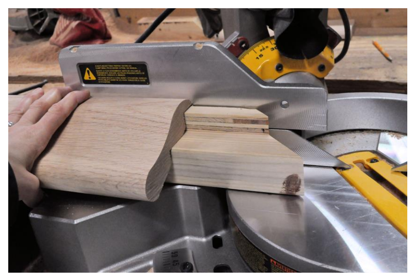
Bar rail in jig at same attitude as installed