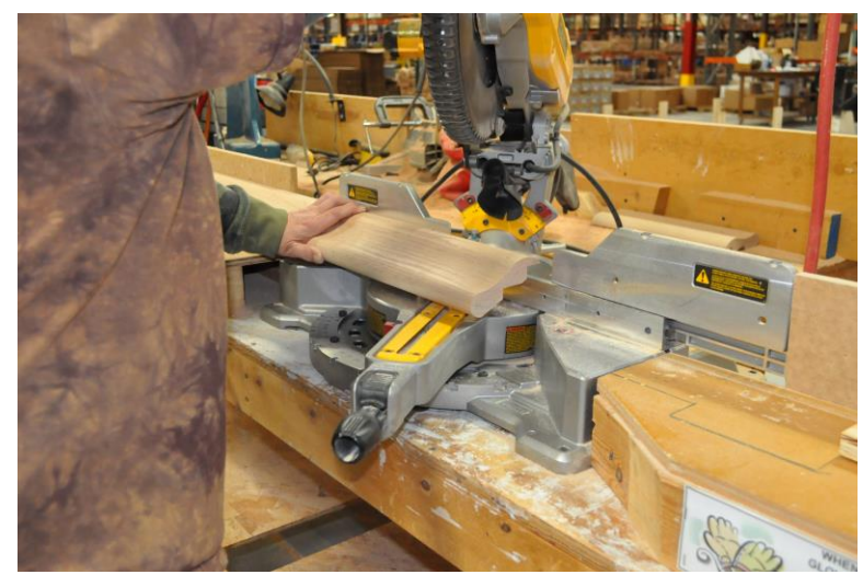
With bar rail in position cut at desired angle with saw vertical