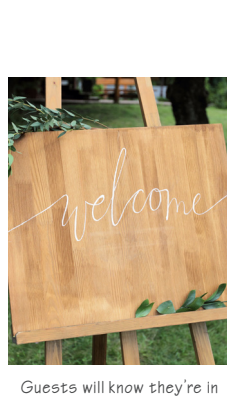
Guests will know they're in the right place with DIY signs