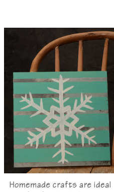
Homemade crafts are ideal gifts for the holidays