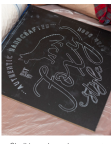
Chalkboards make a great pre-finished black background