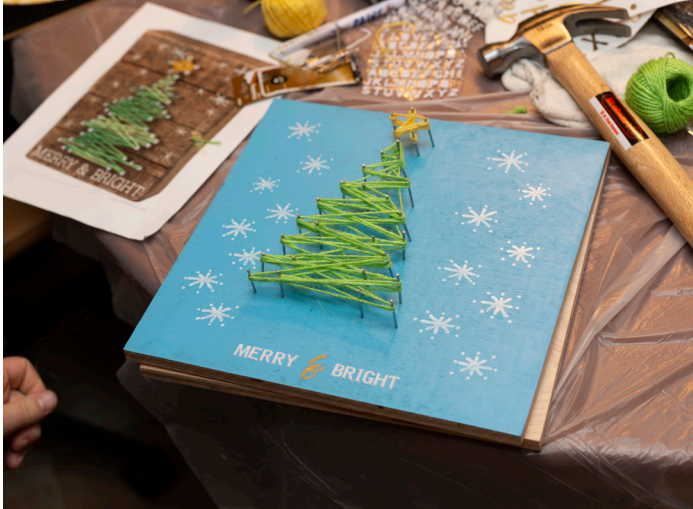
1/2 in. birch plywood is perfect for string art