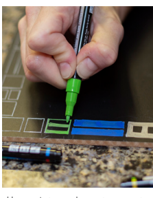
Use paint markers to create a custom chalkboard border