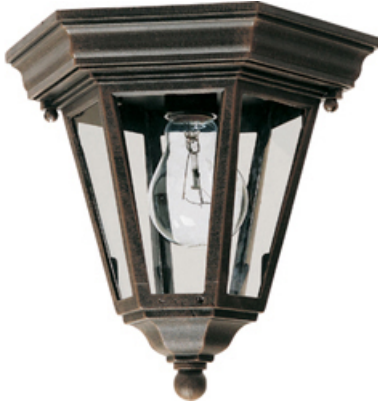
1027RP Westlake Cast 1-Light Outdoor Ceiling Mount