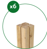
8 in. x 2.5 in. x 2.5 in. Short Posts