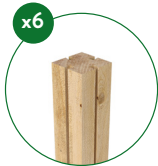
11 in. x 2.5 in. x 2.5 in. Tall Posts