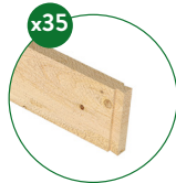
4 ft. x 3.5 in. Boards