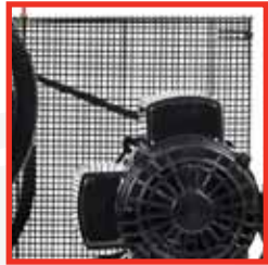
Fully enclosed metal belt guard