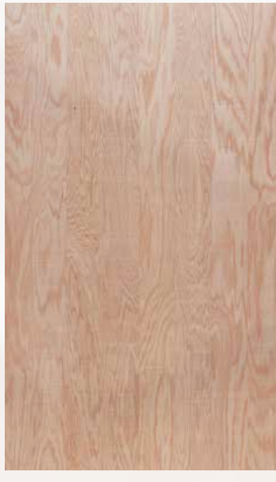
CLEAR RED OAK