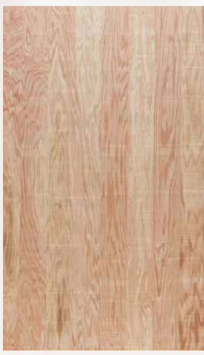
COLORFUL RED OAK