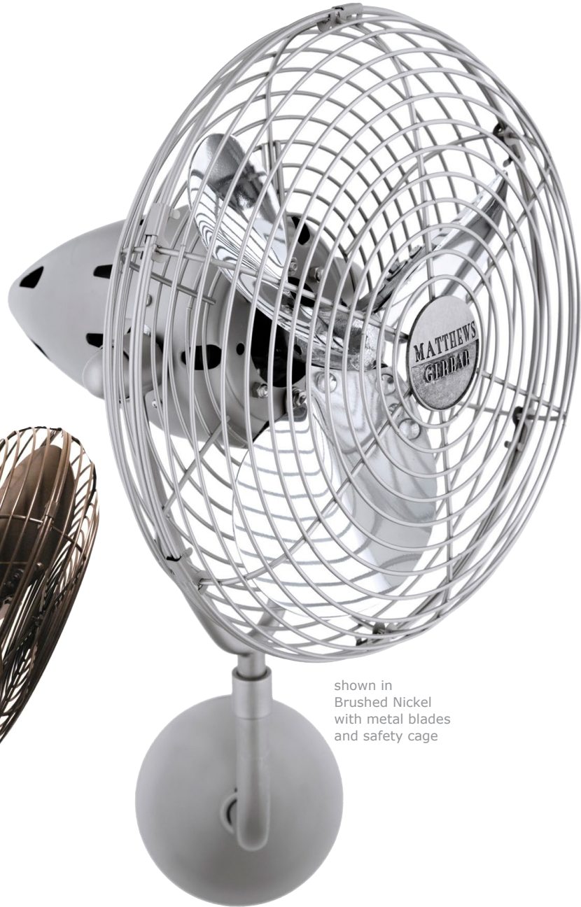
shown in Brushed Nickel with metal blades and safety cage

The Brunna Parede is reminiscent of the wall fans of the early 20th century. The fan head of the Brunna Parede wall mounted fan can be infinitely positioned vertically and horizontally across 180-degree arcs to provide maximum directional airflow. It can be mounted in small, awkward spaces or in front of HVAC ducts to make more efficient the heating, ventilation or air conditioning of any space. Constructed of cast aluminum, heavy spun and stamped steel, the Brunna Parede carries a limited lifetime warranty.