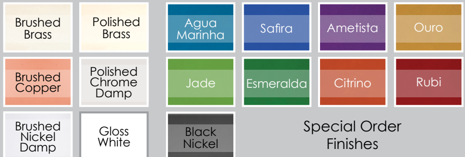
Special Order Finishes