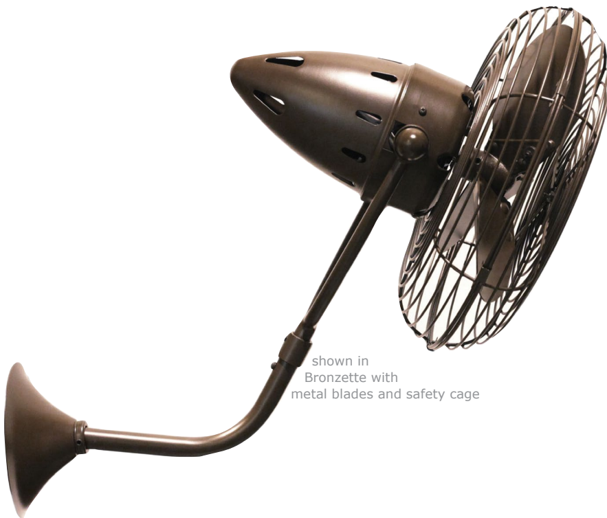
shown in Bronzette with metal blades and safety cage