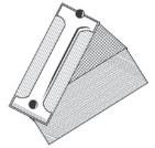
FibaTape® Sand Paper or Sanding Screen and a Pole or Hand Sander

Visit www.fibatape.com to view our easy to follow "How-To" videos!