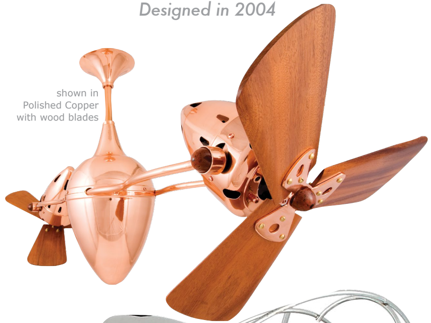
shown in Polished Copper with wood blades