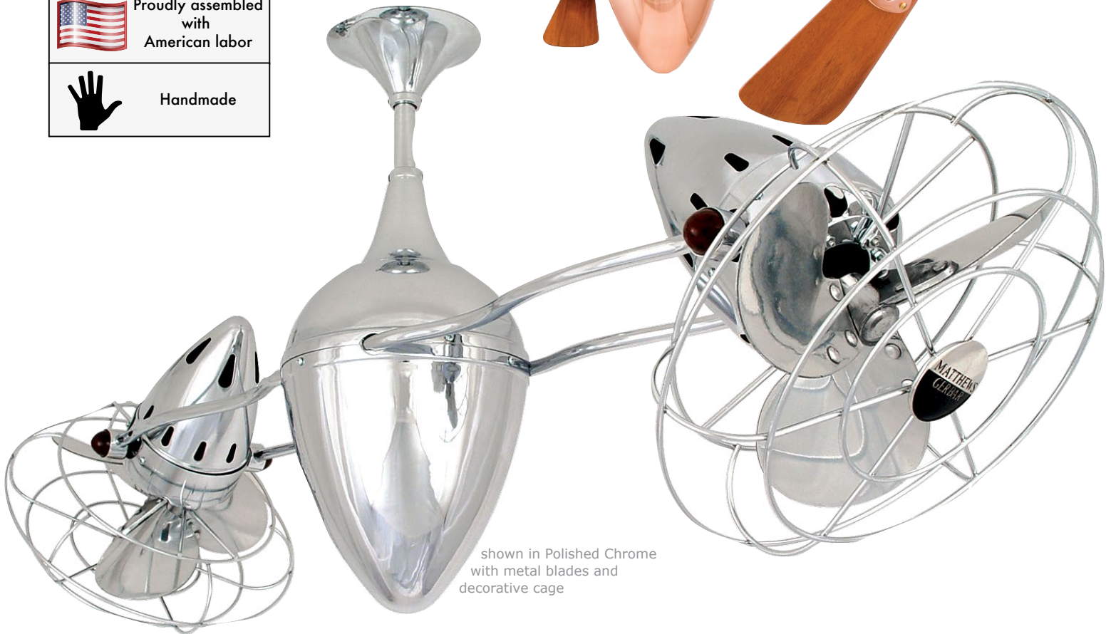
shown in Polished Chrome with metal blades and decorative cage

The Ar Ruthiane's unique hourglass support arms grasp bullet-shaped motor housings which rotate 360° about its teardrop center. The fan heads can be infinitely positioned in 180-degree arcs for optimum air movement; the greater the angles of the motors to the horizontal support rods (up or down), the faster the axial rotation. A slow, controlled axial rotation is achieved by both fan head position and fan blade speed. Matthews 360° rotational fans circulate heat and air conditioning more efficiently than traditional paddle fans. Constructed of cast aluminum, heavy spun and stamped steel, the Ar Ruthiane carries a limited lifetime warranty.