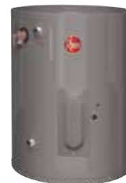
6, 10, 20 and 30-Gallon