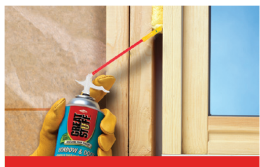
Windows and their rough openings