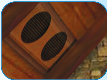
Inside view, available in white or brown.

TC1000-H Ventilator The TC1000H is the only ventilating fan designed and assembled in the USA for use in a solid roof or wall application. Perfect for A-Frame construction or for homes that don't have an attic. Two energy efficient fans move 800 cubic feet of air per minute. A motorized insulated damper seals when the fan is not in use preventing cold air, insects, and the elements from entering your home. The TC1000H is one speed, comes equipped with a wall switch, is maintenance free and has a three year warranty.