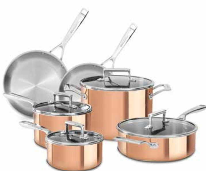
10-PIECE SET SHOWN