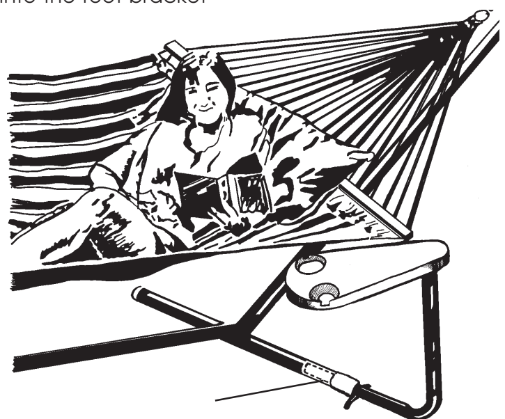
Tri-Beam® Hammock Stand Foot Bracket