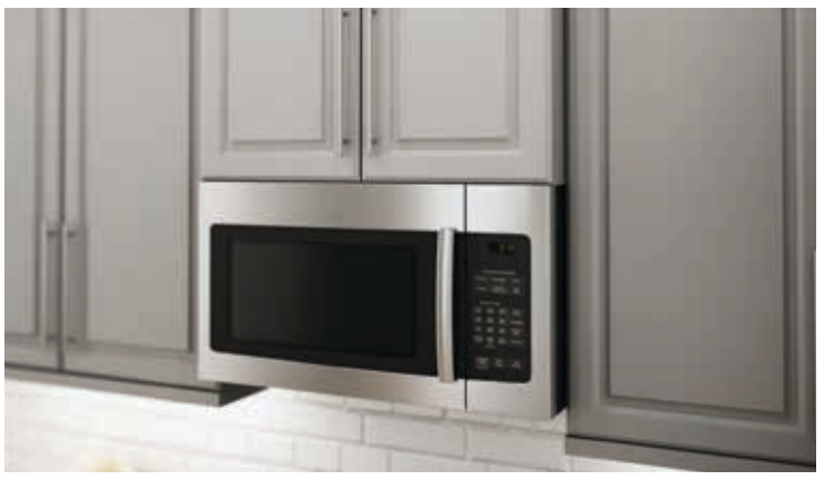
Create a cohesive built-in look for your microwave by adding a bridge cabinet above.