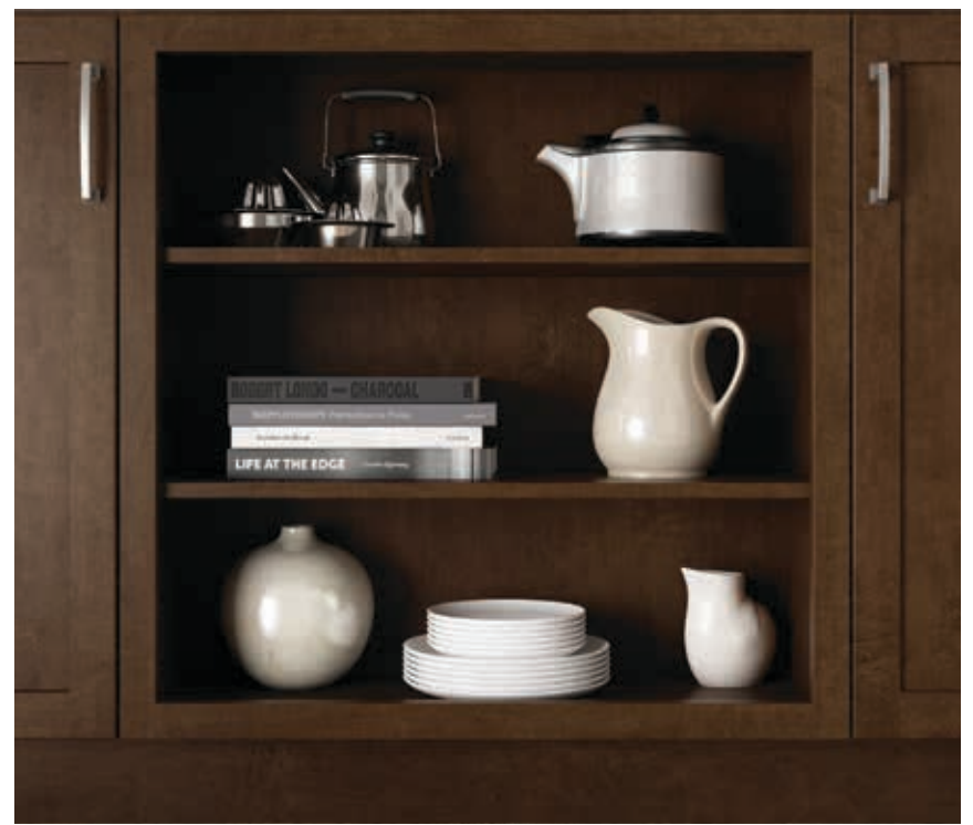
Framed Open Wall cabinets provide open storage for showcasing your favorite decorative pieces, while keeping items within easy reach. Use them for walls or combine creatively with base cabinets in islands and peninsulas.