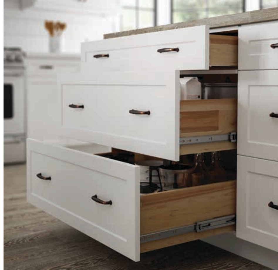
30", 33" and 36" wide drawer bases store bulky pots and pans close at hand. Top drawer is dovetail with soft close glides. The bottom two hardwood drawers feature full-extension heavy duty, soft close glides.