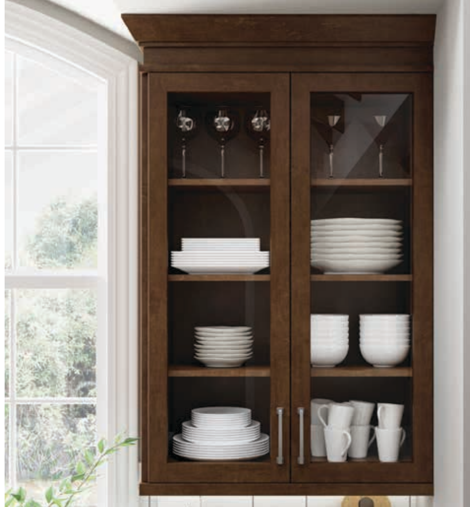
The beauty and classic style of glass. Display treasured items with style behind a clear glass door.