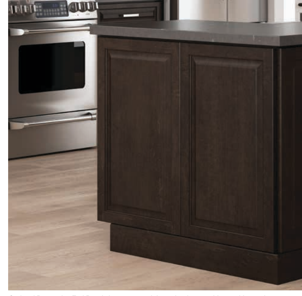
Optional Decorative End Panels let you extend the style of your cabinets with panels that match your door style and finish. Apply to islands, peninsulas, or anywhere you might need a decorative look.