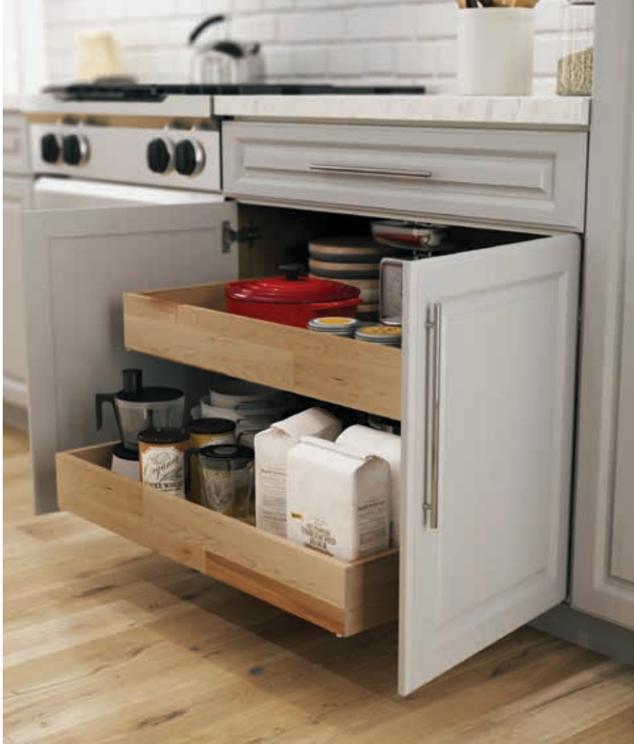
Add Roll-Outs (internal drawers) to any base or pantry cabinet. Great for adding storage for spices or anything the busy cook in your house should want in easy reach.