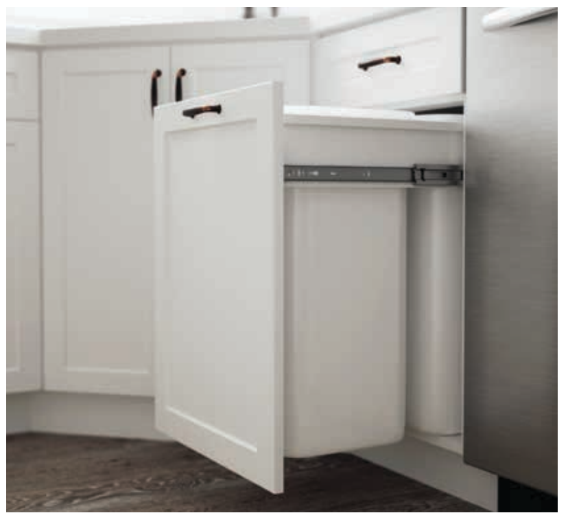
The dual waste bin keeps trash tucked away, keeping the kitchen tidy and floor space open. Recycling is easy with separate bins.