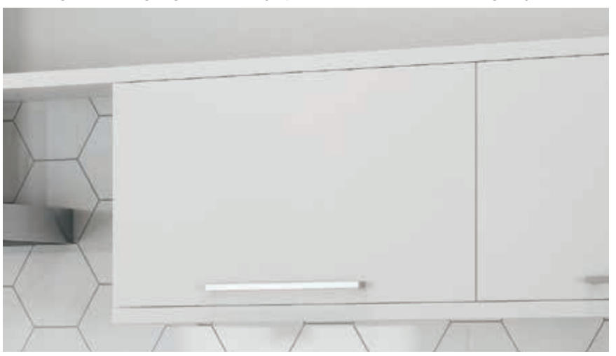
Make a statement with frosted glass or maintain a uniform look with matching doors.