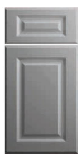
Heron Gray RTF