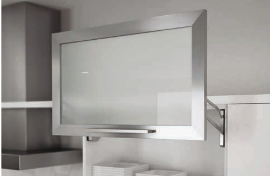
Wall Lift Up cabinets are available in aluminum trim doors with frosted glass or matching doors. Hinges glide smoothly upward when in use and close gently.