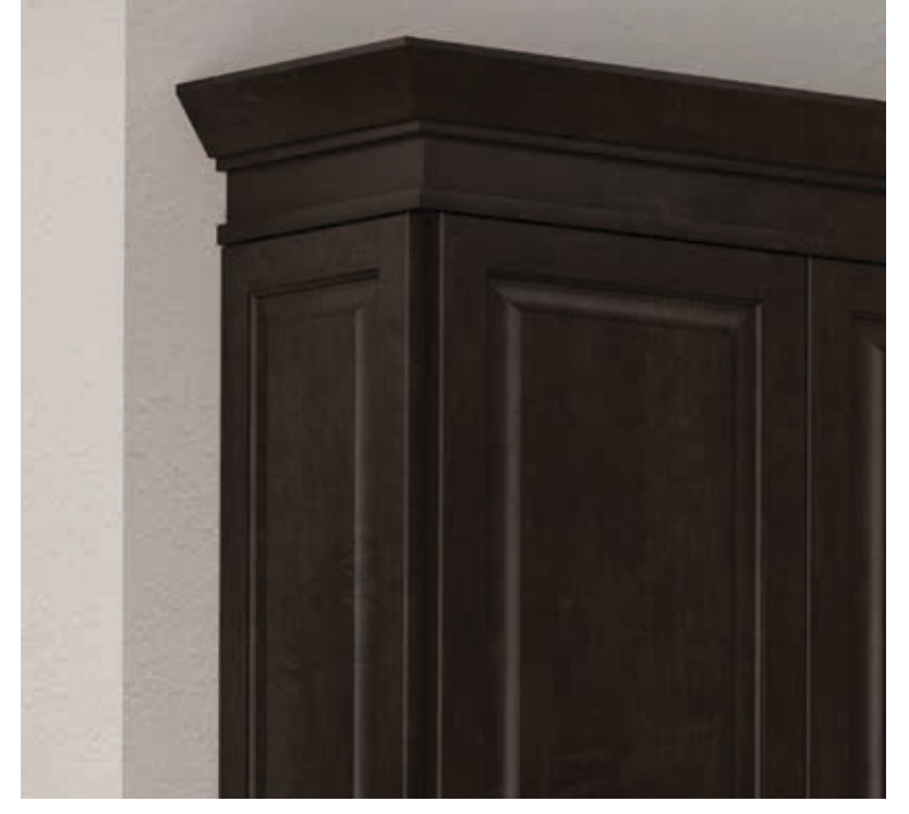
Get that rich, finished look that brings it all together with crown molding available in several styles. Stack them for an extra-special touch.