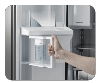
Auto Water Fill