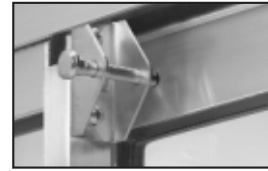
FIG. 5 - LOCK PLACEMENT OPTIONS