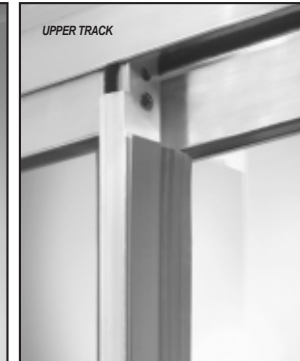
FIG. 4 - WEATHER STRIPPING