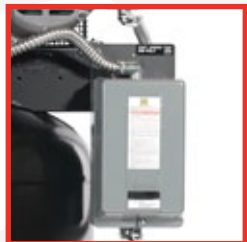
Mounted and wired motor starter