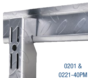
0201 & 0221-40PM