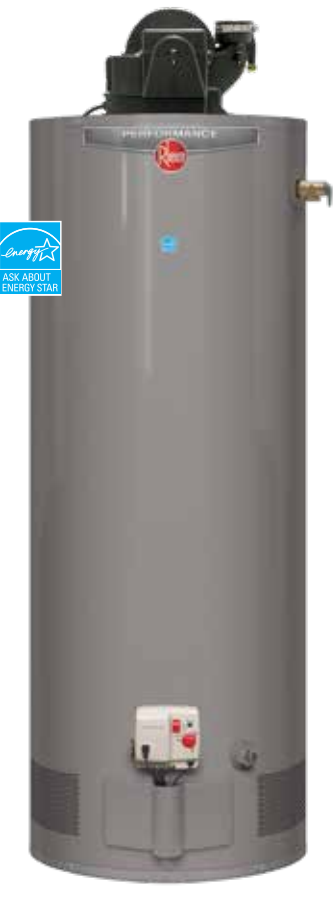
PERFORMANCE Power Vent 40, 50 and 75-Gallon Capacities Up to 42,000 BTU/h

Units meet or exceed ANSI requirements and have been tested according to D.O.E. procedures. Units meet or exceed the energy efficiency requirements of NAECA, ASHRAE standard 90, ICC Code and all state energy efficiency performance criteria.