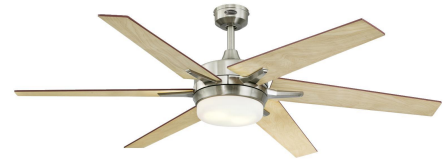
Reversible Light Maple Finish Blades