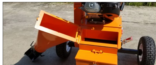
Extended Axle – Dual Swing Chutes