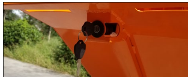
Lock Out Keys