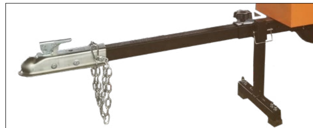
2 inch removable tow bar