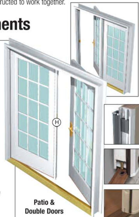
Patio & Double Doors

Our mull systems include inactive seats engineered for perfect panel placement