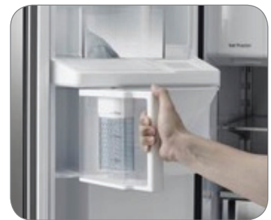
Auto Water Fill