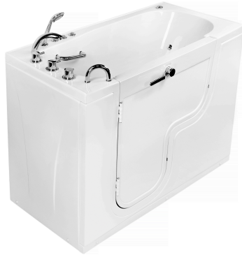
OLA3060D-L Left Drain