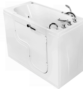
OLA3060D-R Right Drain

Actual Size: 30'' W x 60'' L x 42'' H Shipping Size: 32'' W x 62'' L x 50'' H Shipping Weight: 300lbs. Net Weight: 220lbs. Water Capacity: 95 gal. US (unoccupied) 55-75 gal. US (occupied) Approx. Drain Time: +/- 2 minutes (unoccupied bathtub) at ideal home plumbing conditions Approx. Fill Time: 14 gallons per minute based on in-house water pressure (Disclaimer: Drainage time depends on house drain conditions.)