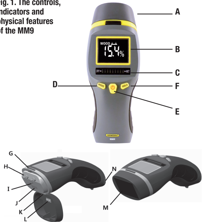
Fig. 1. The controls, indicators and physical features of the MM9

Fig. 1 shows all of the controls, indicators and physical features of the MM9. Fig. 2 shows all possible display indications. Familiarize yourself with the position and function of all components before moving on to the Setup Instructions and Operating Instructions.