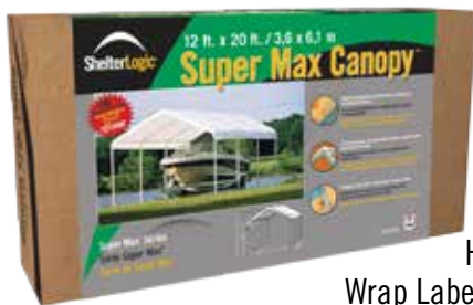
High-Impact Wrap Label Packaging

QUICK & EASY SET UP - With built in slip fit swaged tubing. Wide foot plates on every leg add stability/easy anchor points.