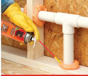
Seal pipe penetrations