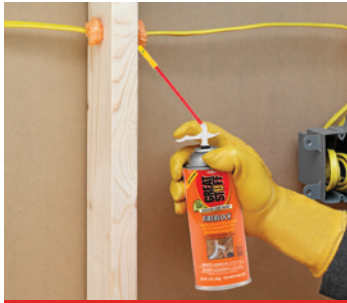
Seal Electrical Through Wall Studs