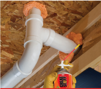
Seal pipe penetrations