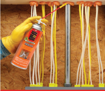
Electrical penetrations through floors