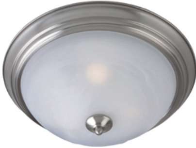
1940MRSN Outdoor Essentials 1-Light Outdoor Ceiling Mount