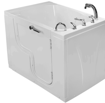
OLA3655A-HB-R Right Drain

Actual Size: 36" W x 55" L x 42" H Shipping Size: 38" W x 57" L x 50" H Shipping Weight: 300 lbs. Net Weight: 220 lbs. Water Capacity: 95 gal. US (unoccupied) 55-75 gal. US (occupied) Approx. Drain Time: +/- 80 sec (unoccupied)* Approx. Fill Time: 7-8 Gallons per minute*