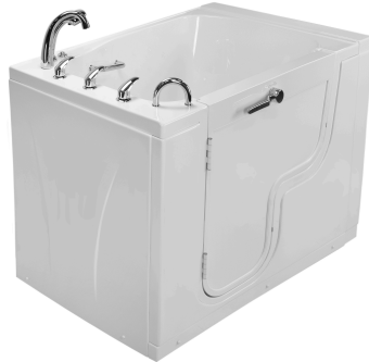
OLA3655A-HB-L Left Drain