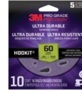
PRO GRADE PRECISION™ 5" Disc