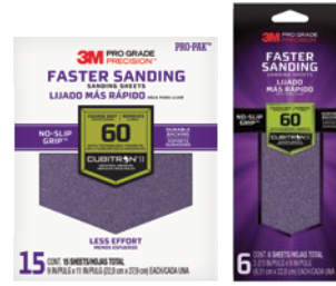
PRO GRADE PRECISION™ with NO-SLIP GRIP™ Backing