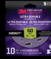
PRO GRADE PRECISION™ 5" Disc