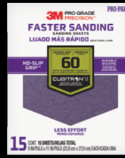
PRO GRADE PRECISION™ with NO-SLIP GRIP™ Backing