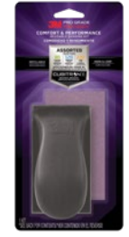
Premium Sanding Tool