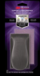
Premium Sanding Tool