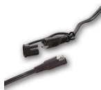
Fig. 1 – J-Plug Connection

5 Year: Warranted to generate up to 80% of rated power