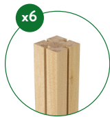
11 in. x 2.5 in. x 2.5 in. Tall Posts