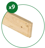
2 ft. x 3.5 in. Boards