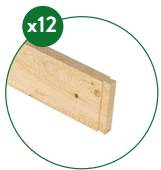
4 ft. x 3.5 in. Boards