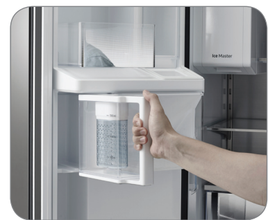
Auto Water Fill