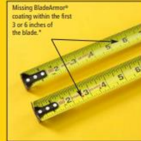
BladeArmor® Coating Missing New, never used tape measures without the BladeArmor® coating within the first 3 or 6 inches of the blade.*