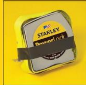
Broken Spring; Blade Will Not Retract Ruler shows little or no wear, no signs of abuse — but blade will not retract into the case or wants to feed itself out of the case mouth.