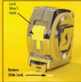
Defective Component Ruler shows little or no wear, no signs of abuse — but one of its components is broken or will not function correctly.