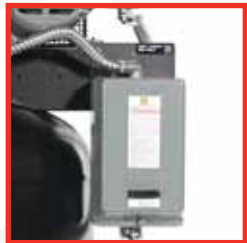
Mounted and wired motor starter