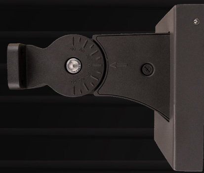
Adjustable Wall Arm