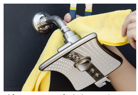
After, wrap a soft cloth over the connection.