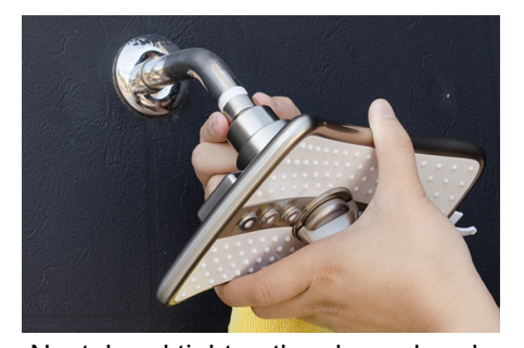
Next, hand tighten the showerhead to the shower arm.