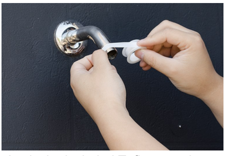
Apply the included Teflon tape by wrapping it around the shower arm threads a few times.