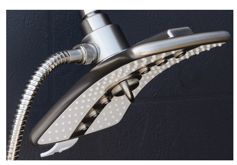
Tighten one end to the showerhead using pliers and a soft cloth.