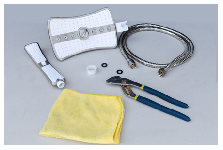
The instructions given are for our general installation guide for all showerheads and/or hand shower combos. To begin installation, pliers and a soft cloth are required.