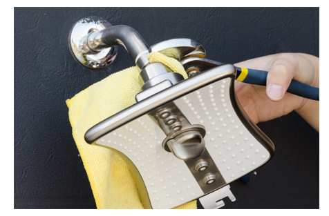
With the cloth fully covering the connection, use pliers to further tighten. Be careful not to mar the surface of the shower head with the pliers.

If you purchased a showerhead your installation is complete. For hand showers and combos, please see the next step.