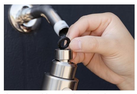
Insert a rubber washer into the showerhead.