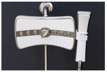
Your installation is now complete.

NOTE: If your showerhead droops, disassemble the showerhead portion and flip the orientation of the rubber washer.