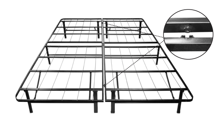
Step 5. Insert two halves together with keyhole locked in place.