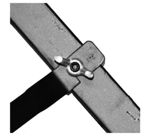
Step 3. Tighten the wing nut until secure. Repeat the same process for all four end legs, making sure all wing nuts are tightly secured.