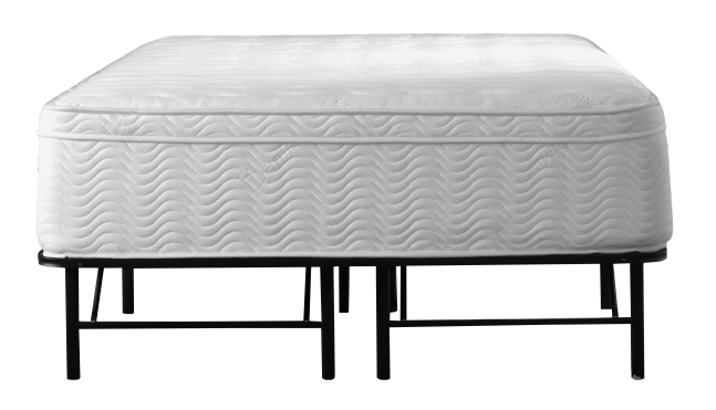
Watch a video with these instructions: