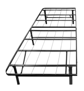
Step 4. Flip the base over to stand upright. Follow the same steps to assemble the other base unit.

Note. For twin size there is only one piece.