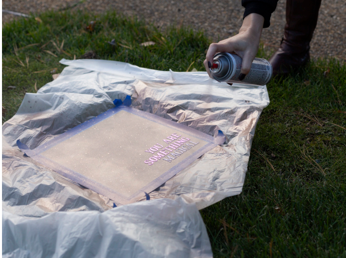
Personalize signs with peel-off letters and spray paint