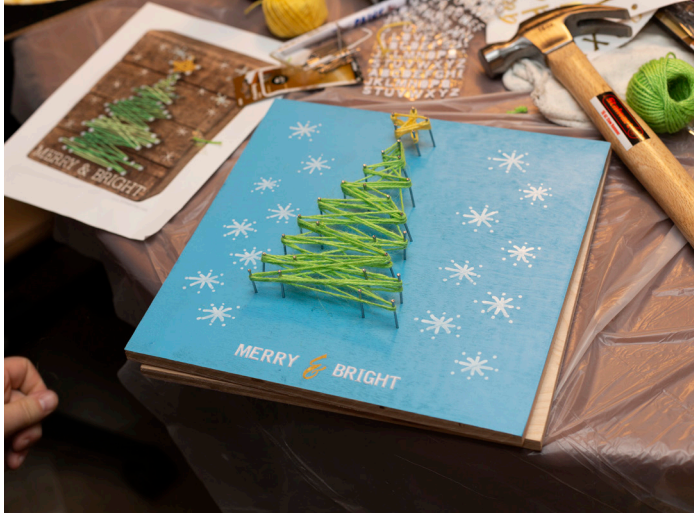
1/2 in. birch plywood is perfect for string art