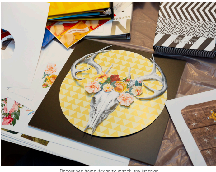
Decoupage home décor to match any interior