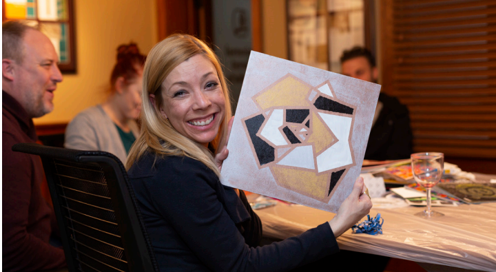
Make one-of-a-kind geometric wall art with tape and paint