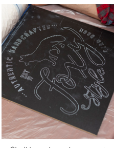
Chalkboards make a great pre-finished black background