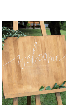
Guests will know they're in the right place with DIY signs