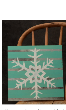
Homemade crafts are ideal gifts for the holidays