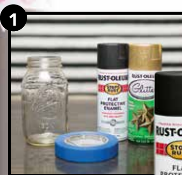
As shown Stops Rust Flat Black, Glitter Gold