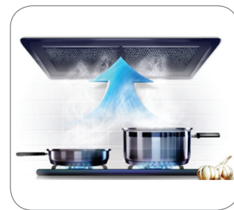
300 CFM Ventilation System