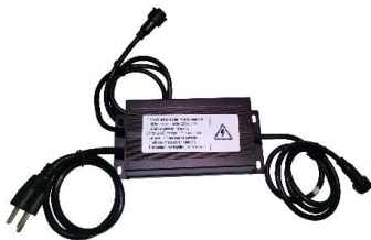
110V Hybrid Adapter Allows fan to run at night (Optional accessory, not included in price)