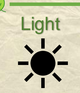
High - Medium

Grown by United Nursery, the Golden Pothos Totem is one of the most 🖈 popular and easiest plant anyone can grow. The Pothos Totem is a very hardy indoor plant and very easy plant to take care of. The Golden Pothos Totem requires no special care once inside your home.