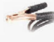
Built in Ground Clamp