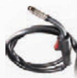
Built in MIG Gun