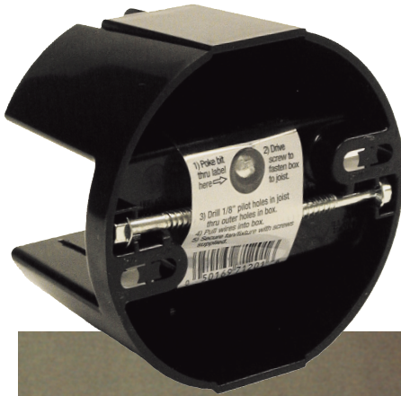
7120-1 & 7120