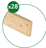
x28 4ft. Boards