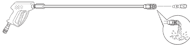
FIGURE 2.3 - GUNVALVE, EXTENSION, & NOZZLE

DO NOT OPERATE GASOLINE AND DIESEL ENGINES IN ENCLOSED AREAS! OPERATE IN WELL VENTILATED AREAS ONLY!