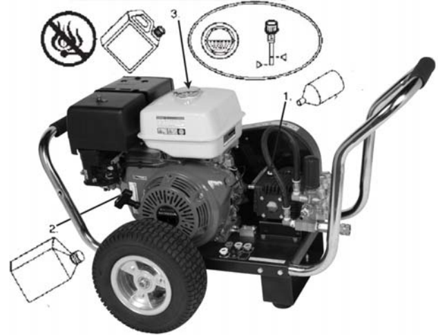
FIGURE 2.1 - CHECK MACHINE