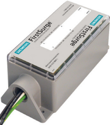
FirstSurge™ Power, Plus or Pro Power Surge Protection for all electrical and electronics inside the home