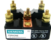
FSPHONE Incoming cable TV or satellite service Surge Protection

What is a Surge? Unfortunately, the term 'surge' has been used to describe every type of power disturbance. However, a surge, sometimes called a transient or a spike, is a brief burst of energy (voltage and current). The most damaging surges enter through your home's power, cable and telephone lines. However, the majority of surges originate within the home from the action of motor based appliances like dishwashers, refrigerators, garage door openers, etc.